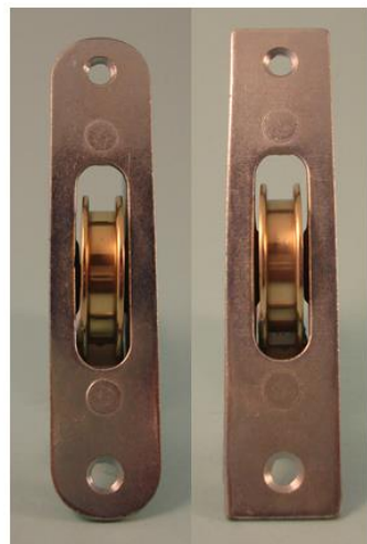
THD252 & THD253