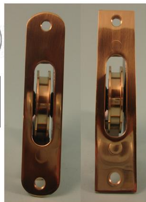
THD138 & THD139